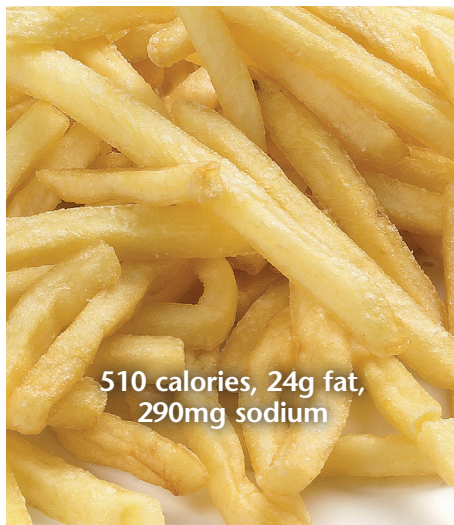
510 calories, 24g fat, 290mg sodium