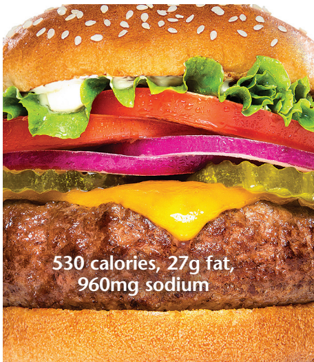
530 calories, 27g fat, 960mg sodium