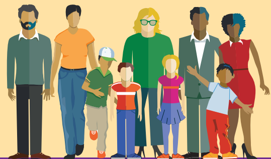
EFNEP Enrollment in North Carolina

86% now practice daily physical activity.